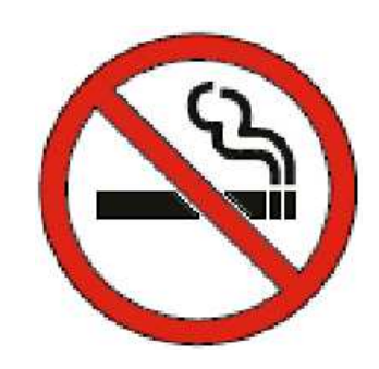
UWMC is a smoke-free hospital.

University of Washington campus is just across N.E. Pacific Street from the hospital, where you will find walking paths, open spaces, and gardens.