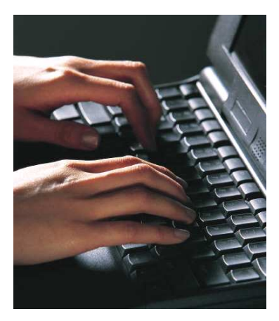
Free Wi-Fi access is available in most areas of the hospital.