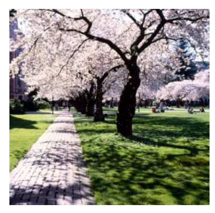
University of Washington campus