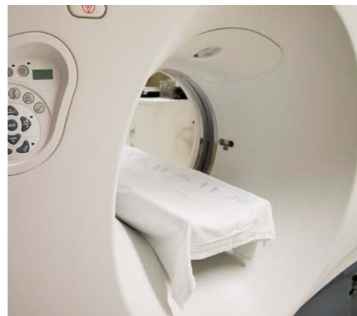
During your scan, you will lie on a table inside the CT machine.

During the scan, you will lie inside the CT machine. Many X-ray beams will be passed through your body as the X-ray tube revolves around you. The machine will take pictures from many angles, forming cross-section images ( slices ) of your neck. Your doctor will review the pictures on a computer.