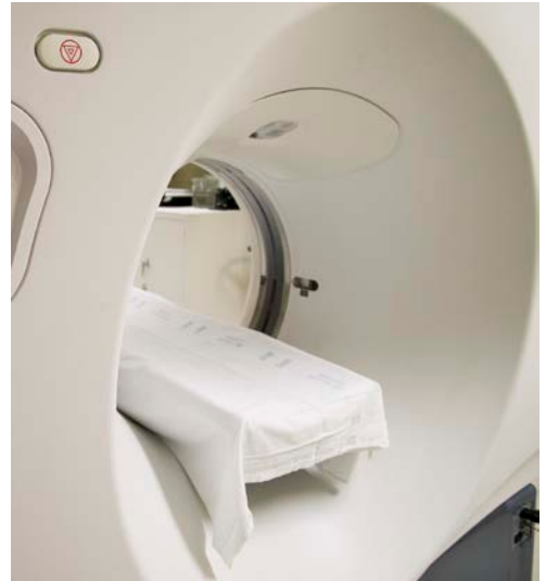
During your scan, you will lie on a table inside the CT machine.