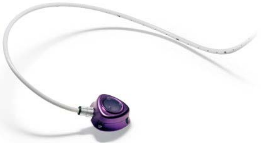
A chest port reservoir and catheter

You will have a thin scar 1 to 2 inches long on your skin. You will not be able to see the port and catheter. But, you may have a small bulge in your skin where the port is.