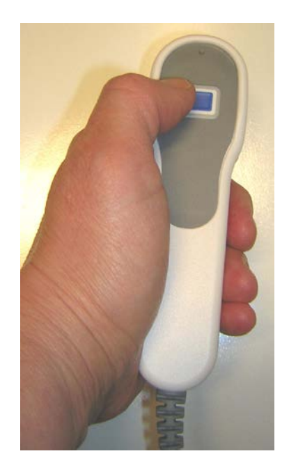
With PCA, you control the amount of pain medicine you receive.

WARNING: Only you should push the button on your PCA. Do NOT let your visitors push the PCA button.