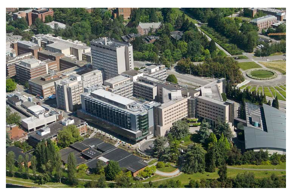
University of Washington Medical Center