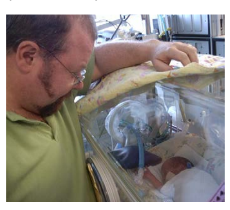
A preterm baby may need to be cared for in an isolette or incubator.