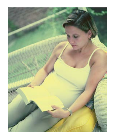
Increase your rest periods if you have preterm labor.